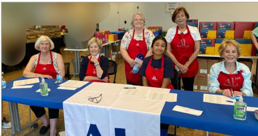
← AL Tulsa volunteers attended Back 2 School at the Gathering Place to help register foster families to receive school clothing from Operation School Bell®.

In August, AL Tulsa participated in Back 2 School , a community initiative organized by Fostering Connections to provide school supplies and clothing to children living in foster care. At a kid-friendly event held at the Gathering Place, foster families were able to sign-up to receive selected items from Operation School Bell®. Over fifty foster children were provided school uniforms, shoes and coats through this special event. AL Tulsa is proud that our partnership with Fostering Connections continues to expand to meet the needs of vulnerable children.